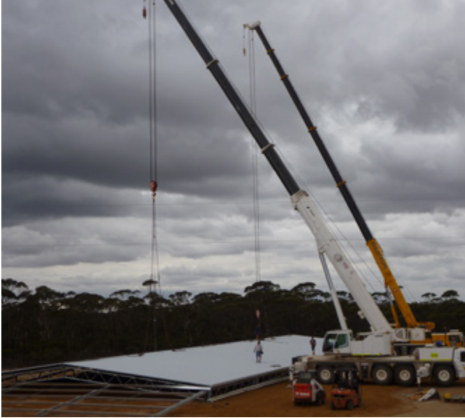
Shed on the ground ready for the "AUSPAN Roof Lift"