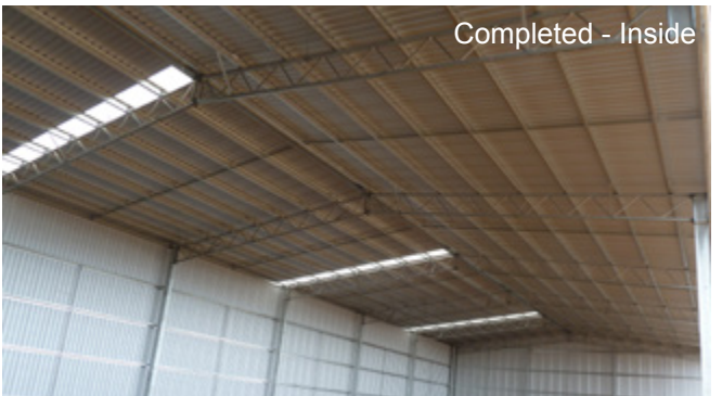
Completed - Inside