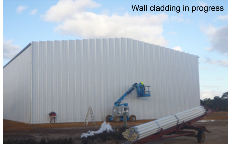
Wall cladding in progress