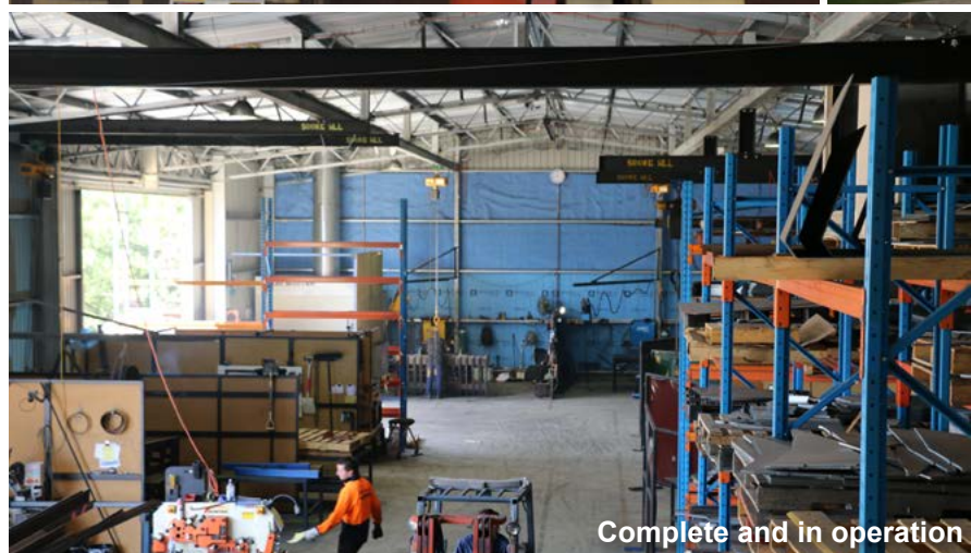
Complete and in operation