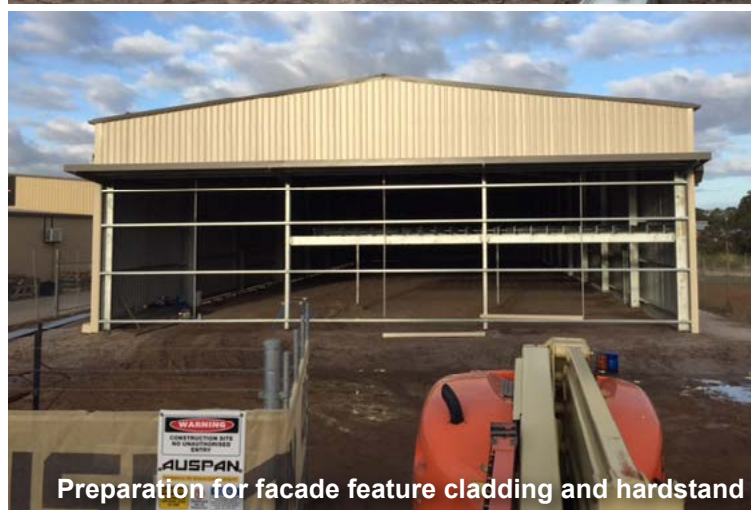
Preparation for facade feature cladding and hardstand