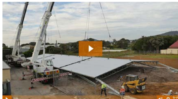
Watch the Himac roof lift video.

http://auspangroup.com.au/video-gallery/