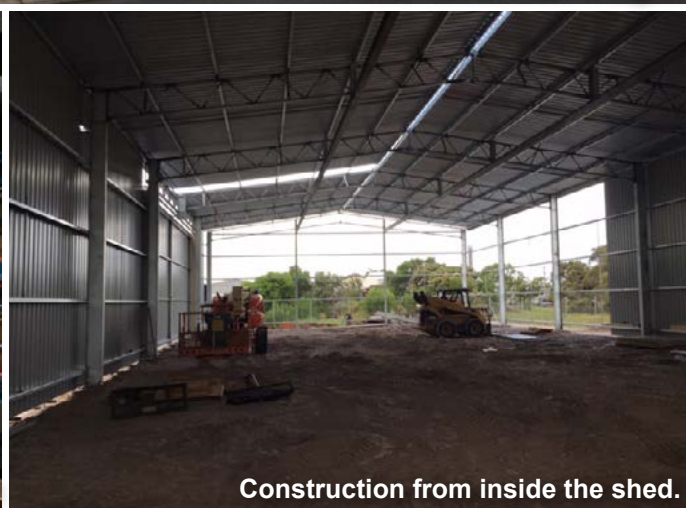
Construction from inside the shed.

CALL TODAY FOR YOUR DESIGN & QUOTE 1300 271 220