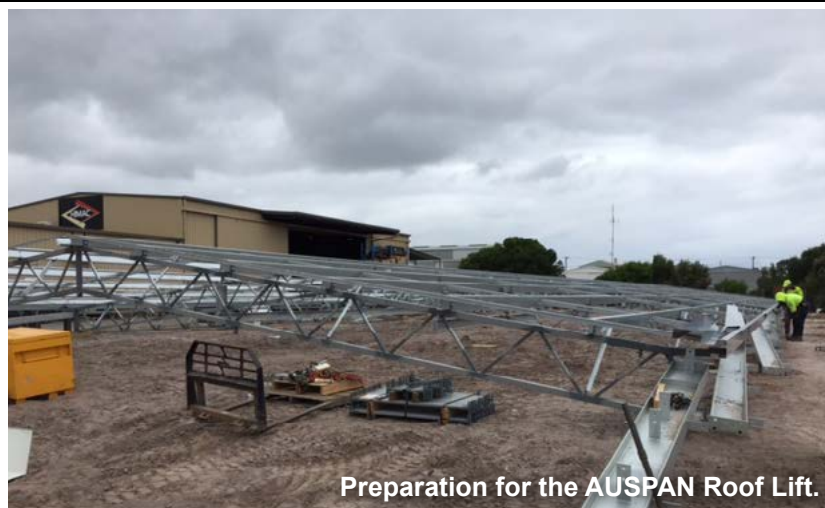
Preparation for the AUSPAN Roof Lift.

WA's LEADER IN THE DESIGN & CONSTRUCTION OF STEEL FRAME SHEDS AND BUILDINGS