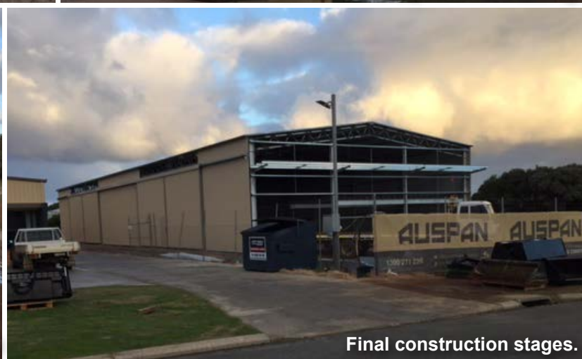
Final construction stages.