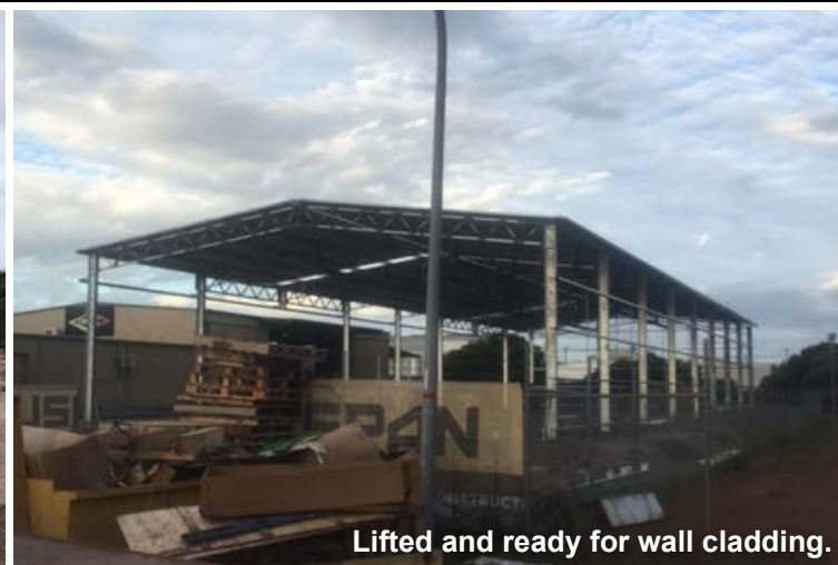
Lifted and ready for wall cladding.